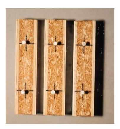
Figure 2. Test specimens for determination of nail withdrawal resistance parallel to the plane of composite panels

The test specimens for determination of nail withdrawal resistance are shown on figures 2 and 3.