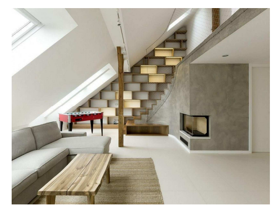
Figure 12 Figure 13