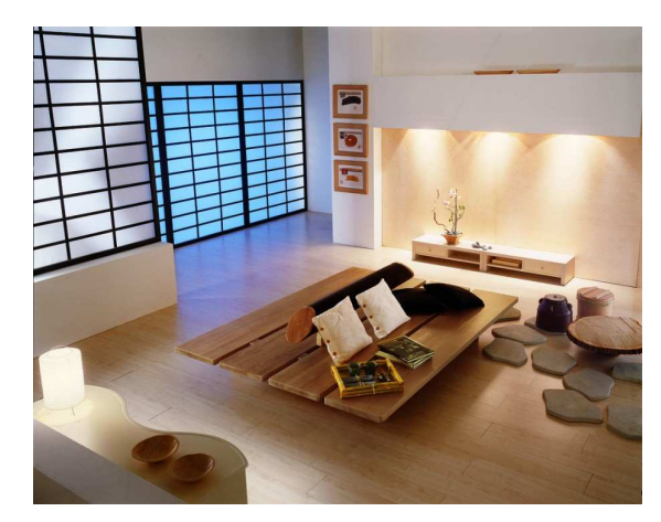
Figure 9 Figure 10

Minimalism influences other arts as well, for example music ("techno" style), photography, poetry (using less words and focusing on the surface description) etc.