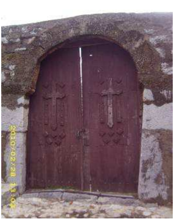
Figure 10. Front door of the church of "St. Virgin Mary Perivleptos"