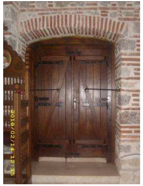
Figure 8. Front door of the church of "St.Panteleimon"

After the Ottoman conquest in the 15<sup>th</sup> century, this church was converted into Imaret Mosque and the relics of "St. Clement" were displaced to the church "St. Virgin Mary Perivleptos", due to which this church was later renamed into "St. Clement". The gates of the church of "St.Clement" ("St. Panteleimon"), date from more recent times, since the church was completely reconstructed in the 21<sup>st</sup> century, rebuilt on its old foundations. All external doors have the same form., at the upper end with a small arch, but the door wings are rectangular. The decorative boards on the door are linear, and the door wings are covered with planks placed vertically, all with the same dimension and interconnected (Figure 8).