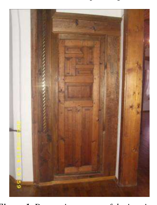
Figure 1. Decoration on one of the interior doors at the house of the Robevcis

A simple craft technique does not only come from the craftsmen's familiarity with making furniture but also with the need to emphasize its functionality. Thus different furniture was created, household items ranging from the simplest to the most complex ones, which was reflection of the relevant area and time in which they occurred. These elements possessed not only functional or aesthetic value, but their totality in the home consisted of items that reflect the spirit of that time, the people and the hosts themselves, ranging from ethnicity, social status or areas from where the object originated. That is why the design of doors and portals is not a case or a product of individual creativity or one's talent. These studies confirm that the existence of one same motive on Macedonian land can be traced back to prehistoric eras. This fact imposes a conclusion according to which the furniture in its very iconic design existed and evolved as a matrix by itself on previously established grounds and was guided by habits, traditions and a specific genetic code of our nation.