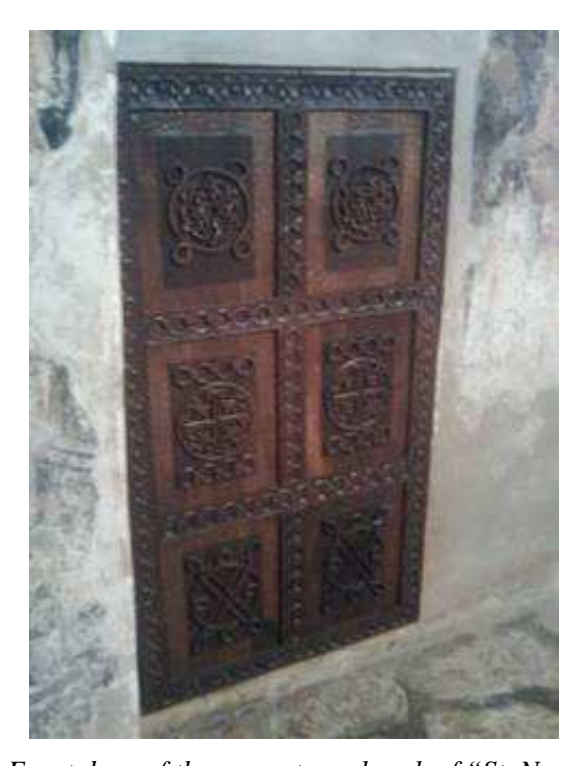
Figure 11. Front door of the monastery church of "St. Naum Ohridski"

The symbolic decoration of portals and doors is an expression process between the internal thoughts and outside life. Analyzing the semantics of decoration and the need to express the craftsmen's talents by drawing and carving the doors, we come to a conclusion that this processes was