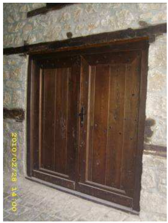
Figure 5. Front door of the house Uranija

Specially and geometrically decorated door is the one of the guest room in the memorial house of Hristo Uzunov. The door is located on the top floor of the house, and is an integral part of the overall interior design of this room. The two upper parts of the door are equal, and the bottom is smaller. The door wing has mostly square form. In the box a smaller square is inscribed at an angle of 45 degrees. Inside it there is a smaller square placed vertically to the first one. Iniste the second square centrally was placed a smaller square with four rectangles around it, two of which are horizontally placed and other two vertically (Figure 6 and Figure 7).