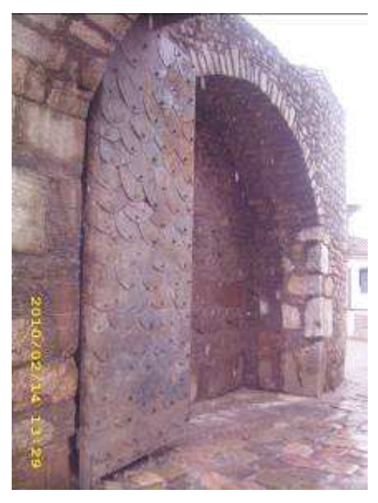
Figure 2. Upper Gate at the "Samuel Fortress"

"Samuel Fortress," with its massive towers and walls surrounding the Ohrid Kale. Uppermost part of the town was protected from all sides except the south, since Ohrid Lake is in the South, and the other part is surrounded with towers and high walls that extend to the port. Today's form of the fortress is from the time of Samuel, the 10^{th} century, and it features eighteen towers, three of which are semi-circular and fifteen of them are with square formed from four major gates.