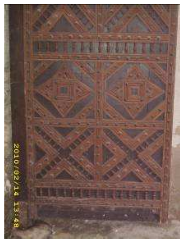
Figure 9. Front door of the church of "St Clement", today "St. Virgin Mary Perivlepos"

interior, a sense of styling the natural forms and same choice of authentic motifs. All these elements are included in the interiors of Macedonian revival houses in the artistic category of folk art.