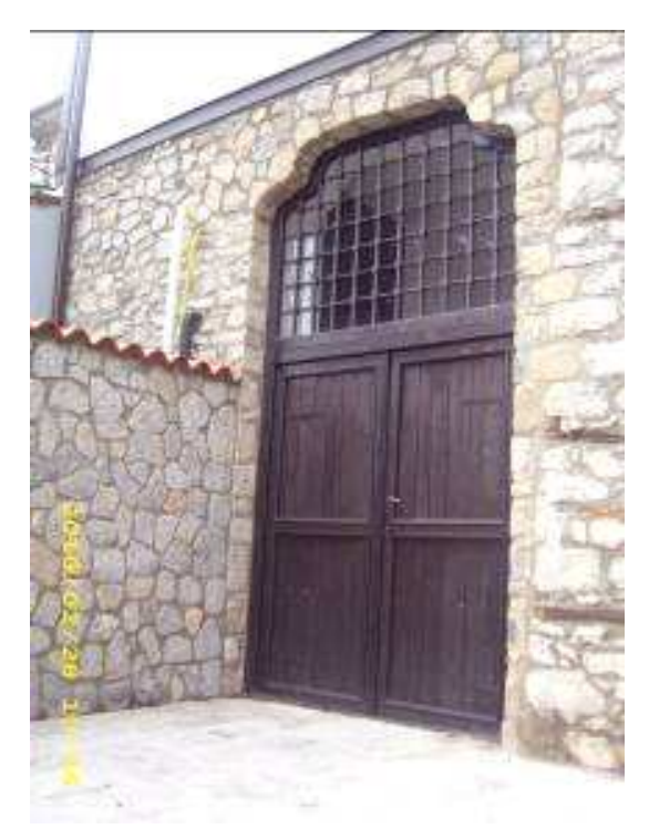
Figure 5a. Front door of the house Uranija