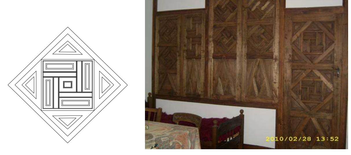
Figure 7. Geometrical decoration was an integral part of the overall interior design (one of the interior doors at the house of Hristo Uzunov)