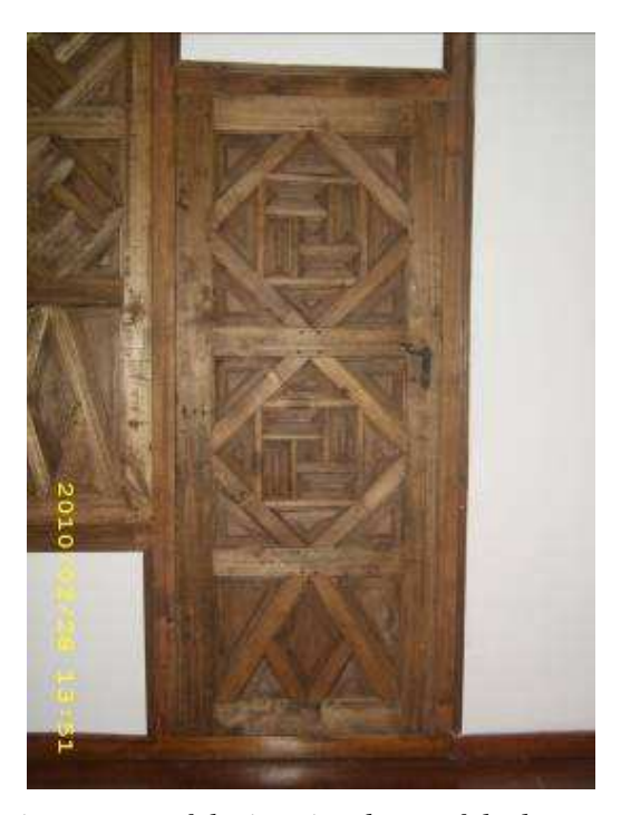
Figure 6. Decoration on one of the interior doors of the house of Hristo Uzunov.