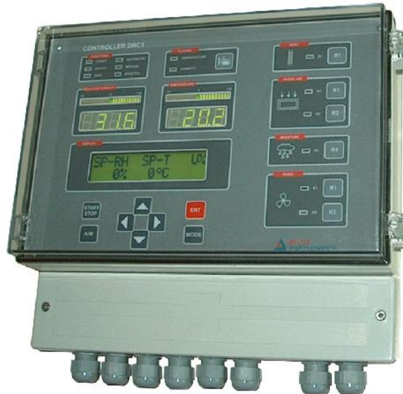
Figure 1. Programmable controller for computation, measurement and automatic control of T and RH , produced by Delta Instrument Ltd. Sofia

The controller, shown in Fig. 1, is designed to measure the temperature T and the relative humidity RH of the air in the chamber, to compute the set-point values of T and RH , and to control the whole lumber drying process. The temperature and the relative humidity RH are measured by a probe, which is produced by the Swiss Firm ROTRONIC. Two miniature sensors are mounted on its tip – one a resistance thermometer Pt-100, and another – a high-temperature capacitive sensor for RH .